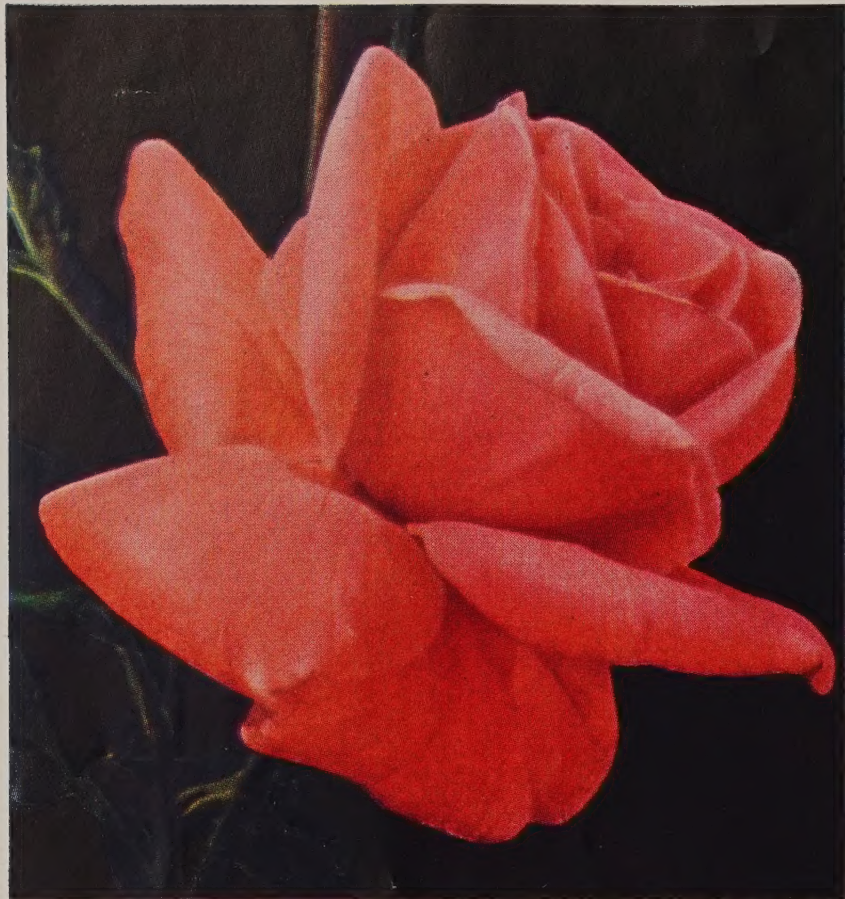
DOUGLAS MacARTHUR (Pat. 581)—$1.50 each; 3 for $3.75.

ALEZANE —Plant Pat. No. 116. Bud urn-shaped, reddish-brown; flowers cupped, opening to sorrel, unfurling to rich apricot; reverse of petals sorrel, striped with yellow veins. $1.25 each, 3 for $3.15.